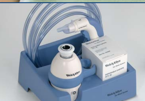
Portable Storage Tray — Compact and easy to transport safely from room to room.

Simplicity. Cleanliness. Safety. Efficiency. Welch Allyn's Ear Wash System with Hydrovac Action is a state-of-the-art concept in cerumen removal. Unlike other irrigation devices, the Ear Wash System eliminates messy outflow by automatically dislodging, removing, and disposing of cerumen. And with all its built-in safety features, the Ear Wash System is ideal for use on patients of any age.